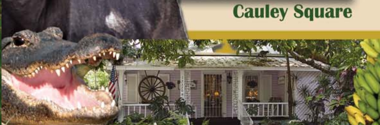
Schnebly Winery & Brewery